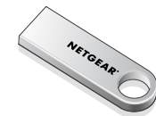
USB thumb drive