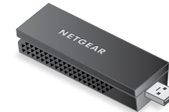
WiFi USB adapter