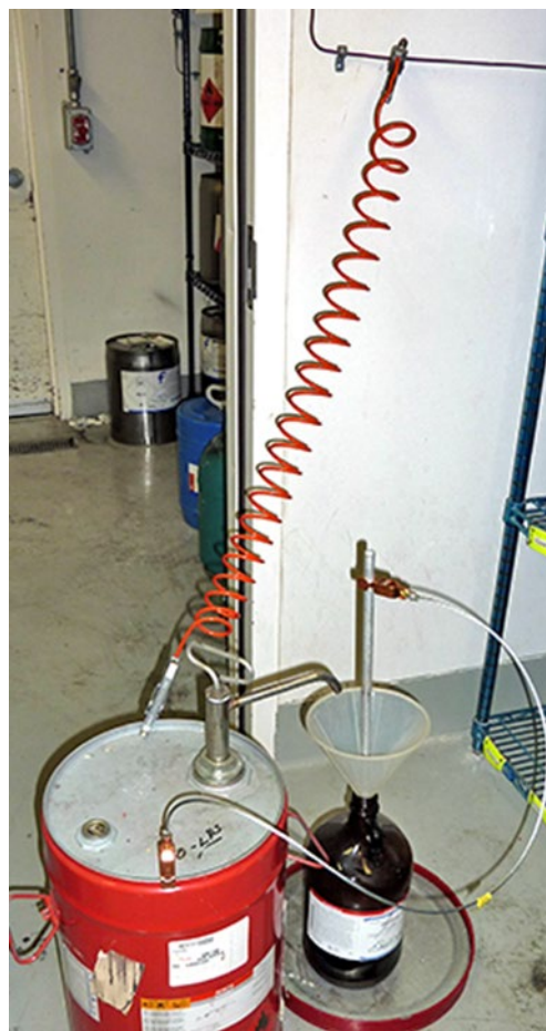
This image shows dispensing into a glass container. Note the ground rod inserted into the funnel.

Polyethylene safety cans are equipped with a grounding lug designed to attach to ground wires.