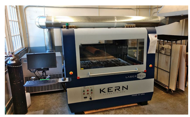
UW Mechanical Engineering laser

The purchase of a laser cutter/engraver requires prior approval from Environmental Health and Safety (EH&S).