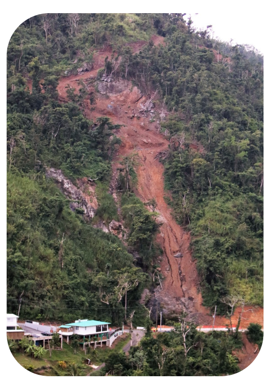
Landslide in the Municipality of Naranjito.