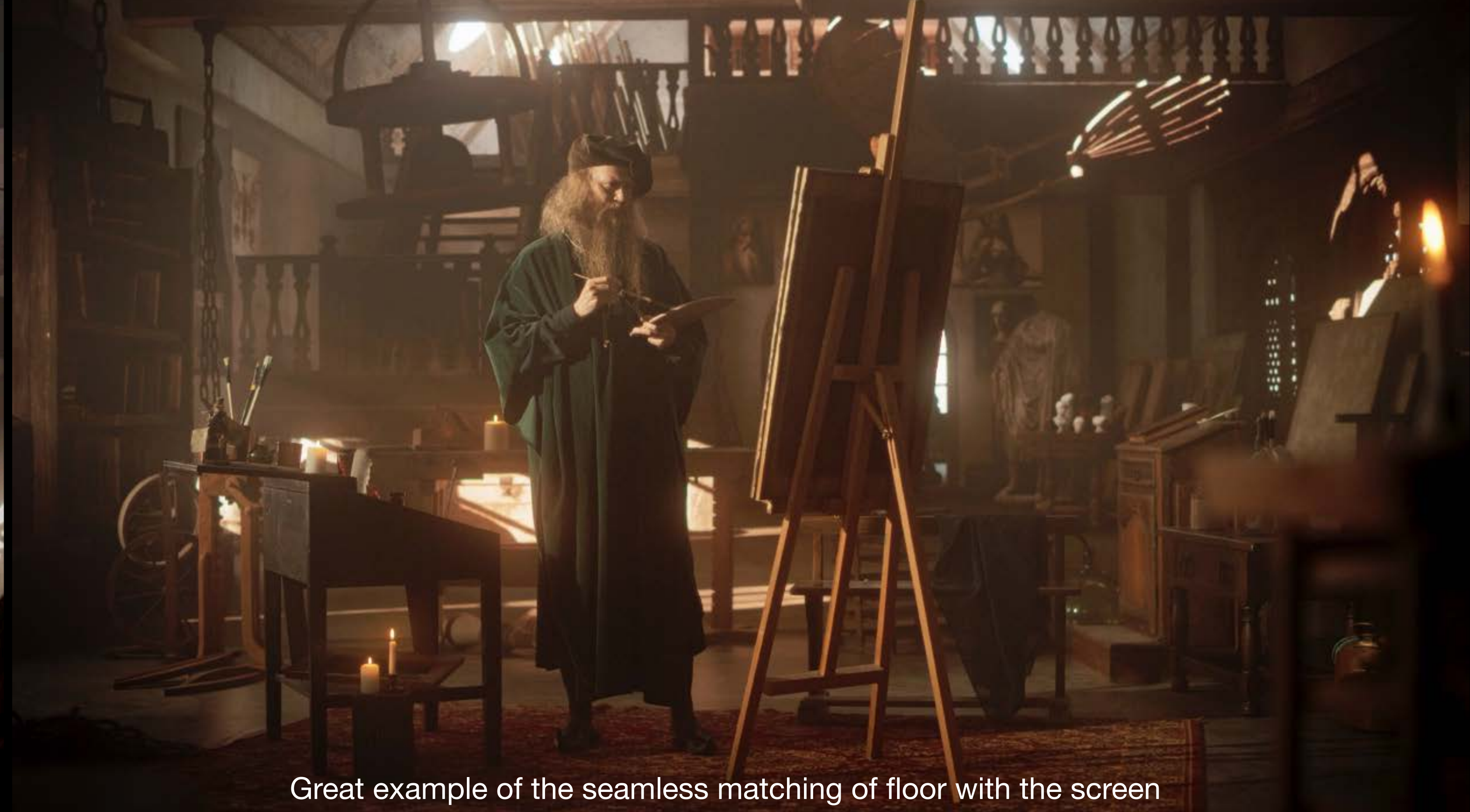
Great example of the seamless matching of floor with the screen