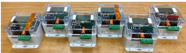
Figure 1. ARGEMS devices prior to shipment.

PROJECT STATUS/RESULTS: ARGEMS devices have been successfully deployed at UH Mānoa, Arizona State University, Chulalongkorn University (Thailand), and in Okinawa, Japan. The latest version is shown in Figure 1 and examples of analysis and visualization are shown in Figure 2.