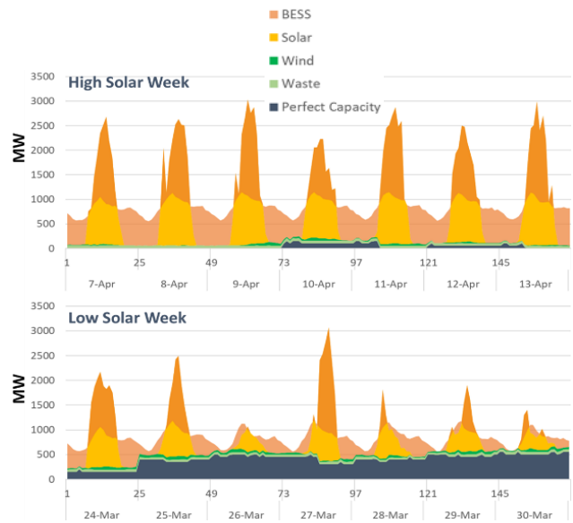
Figure 2. Representative high and low solar weeks and the need for firm renewables.

The scenarios and perfect capacity resources were modeled across 21-years of weather resources (which represented historical weather conditions from 1998-2018) for the solar and offshore wind resources. The model was evaluated across all hours of the year in the 21-year period, creating dispatch profiles for nearly 184,000 hours of chronological operations, illustrated in Figure 2. The use of multiple years of resource for this analysis, inherently considers the impact of historic periods of low resource.