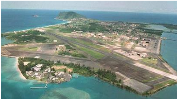
Figure 1. Aerial View of MCBH at Kaneohe Bay.

OBJECTIVE AND SIGNIFICANCE: HNEI completed an assessment of energy generation and resilience opportunities (“EG&R Assessment”) for Marine Corps Base Hawai‘i (MCBH) (Figure 1). This study sought to identify and evaluate needs and opportunities for implementing cost-effective and commercially proven microgrid technologies (e.g., solar photovoltaics (PV), battery energy storage systems (BESS) and back-up diesel generation) on MCBH, while concurrently meeting MCBH’s 14-day resiliency requirement.