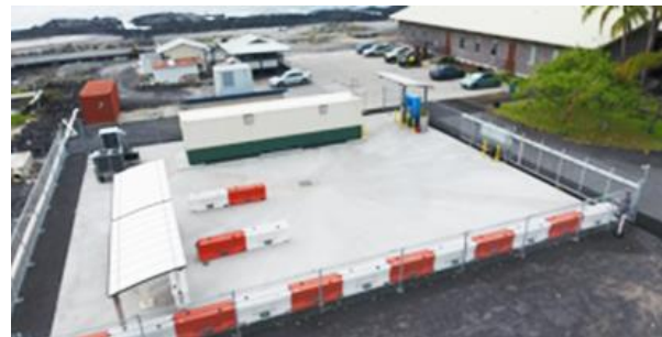
Figure 3. HNEI's NELHA hydrogen station.

Hydrogen Station: The site infrastructure, as well as the hydrogen production and compression systems equipment, have been installed at NELHA (Figure 3). In 2021, the station was fully commissioned by HNEI and Powertech, the equipment supplier. The first fill of a hydrogen bus for public transportation took place on March 24, 2022.