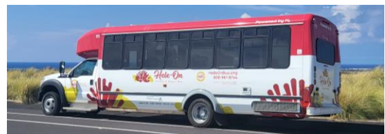
Figure 8. Hele-On 21-passenger FCEB.

Hele-On 21-Passenger Fuel Cell Electric Bus: The Hele-On 21-passenger FCEB (Figure 8) was purchased with funds from the Energy Systems Development Special Fund. This bus, manufactured by Eldorado National, and converted to a hydrogen-electric drive train by U.S. Hybrid, is ADA-compliant. Within the last year, the fuel cell power system was upgraded by replacing the original 30 kW Hydrogenics fuel cell with a new state-of-the-art 40 kW U.S. Hybrid fuel cell. During commissioning, the fuel cell produced 46 kW, a 15% improvement, and the range increased from 200 to 300 miles, a 50% improvement.