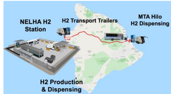
Figure 2. Concept for hydrogen transport on Hawai'i Island.

electric vehicles. HNEI has delivered training to bus drivers and First Responders.