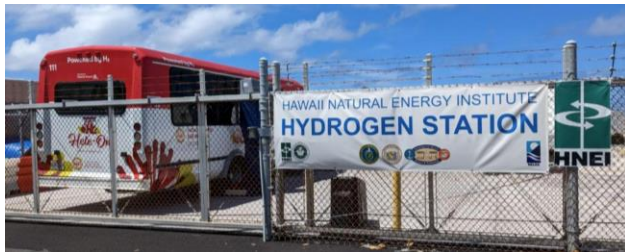
Figure 1. HNEI's NELHA hydrogen station.

OBJECTIVE AND SIGNIFICANCE: In 2022, HNEI commissioned a 65kg/day hydrogen production and dispensing station on the Island of Hawai'i at the Natural Energy Laboratory Hawai'i Authority (NELHA) (Figure 1) and demonstrated on-site fueling of an electric-fuel cell hybrid bus. The overall objective of the project is to evaluate the technical and financial performance and durability of the equipment, and support a fleet of three hydrogen Fuel Cell Electric Buses (FCEB) operated by the County of Hawai'i Mass Transit Agency (MTA). The knowledge gained in this project will inform the MTA on benefits and issues associated with transitioning from a diesel bus fleet to a zero emissions FCEB fleet in support of the County of Hawai'i's clean transportation goals. The knowledge will also help inform decisions on other islands.