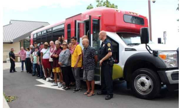
Figure 14. “Meet the Bus” event on Hawai‘i Island.

Public Outreach: On July 11, 2023, attendees of the “Meet the Bus” event (Figure 14) in West Hawai‘i gathered for a photograph in front of the island’s first ever hybrid hydrogen electric bus. Hawai‘i County Mayor Mitch Roth said, “look at what comes out of the vehicle – you don’t see smog; you just see water coming out. We’ve been looking at ways to have green energy, and hydrogen looks like the way of the future.”