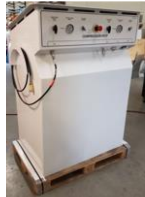
Figure 7. MTA boost compressor fueling post.

to reduce transportation costs by not having to return half-filled trailers to be refilled at NELHA.