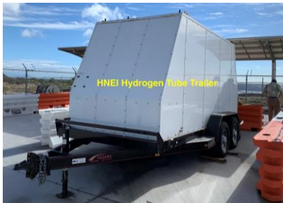
Figure 5. Hydrogen transport trailer.

Hydrogen Transport Trailers: Three trailers (Figure 5) are available for transport between the production and fueling site and are certified by the Federal Transit Administration for use on U.S. public roads. The hydrogen cylinders must be recertified every five years.