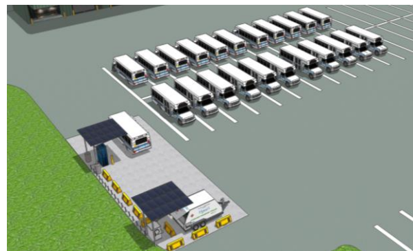
Figure 12. Concept of MTA site with fueling dispenser.

Hydrogen Station Energy Consumption: The total power consumption of the hydrogen system including the electrolyzer, compressor, and balance of plant is ~210 to 240 kW when operating at the maximum production rate of 65 kg/day (2.7 kg/hr). This corresponds to approximately 78 to 88 kWh/kg of compressed hydrogen. Figure 13 and Table 1 provides the breakdown of the observed power usage. This represents the largest single load on the NELHA research campus grid.