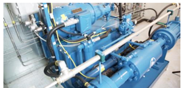
Figure 4. HydroPac compressor.

The station uses a Proton Onsite (now Nel) electrolyzer to produce 65 kg of hydrogen per day at an outlet pressure of 30 bar (440) psi. A HydroPac compressor (Figure 4) compresses the hydrogen to 450 bar (6,600 psi).