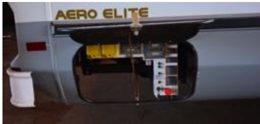
Figure 9. Bus export power unit.

A 10 kW export power system (Figure 9) was installed in the 21-passenger bus to enable the bus to provide 110/220VAC electric power at full power for up to 30 hours as emergency power for civil defense resilience operations when the grid power is down. The bus can be refueled in ~15 minutes providing an additional 30 hours of emergency power.