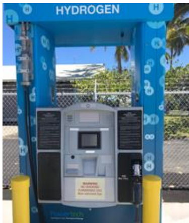
Figure 6. Hydrogen station dispenser.

Hydrogen Dispensing System: The dispensing system consists of a dispenser (Figure 6) connected to a fueling trailer through a fueling post interface that is connected to the dispenser via an underground hydrogen piping distribution system. The hydrogen dispenser is fully automated and programmed to “fail safe” for unattended operation.