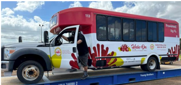
Figure 10. HAVO 19-passenger FCEB.

Hele-On 19-Passenger Fuel Cell Electric Buses: Two 19-passenger FCEBs (Figure 10) were acquired by the MTA from Hawai‘i Volcanoes National Park (HAVO). These buses were converted by U.S. Hybrid and are of similar design to the 21-passenger FCEB. Onboard hydrogen capacity is 10 kg giving a projected range of 100 miles. These buses are being upgraded with 90 kW Hyundai fuel cells and one 33 kWh A123 Lithium-ion battery using funding provided by the County of Hawai‘i.