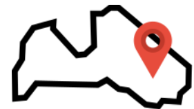
Rezekne Academy of Technologies