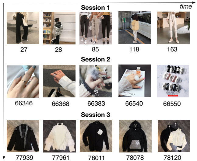
Figure 1: Here is one demo of sessions collected from a real-world industrial application. The number beneath the picture indicates the time gap, specified in seconds, between the time of clicking on the current item and that of clicking on the first item. Sessions are divided in the principle of whenever there exists a time gap of more than 30 minutes.

Recommender systems (RS) are becoming increasingly indispensable in assisting users to find their preferred items in web-scale applications such as Amazon and Taobao. Typically, an industrial recommender system consists of two stages: candidate generation and candidate ranking [Covington et al. , 2016]. The candidate generation stage adopts some naive but time-efficient recommendation algorithms (e.g. item-based collaborative filtering [Sarwar et al. , 2001]) to provide a relative small set of items from the huge whole item set for ranking. In the candidate ranking stage, complex but powerful models (e.g. neural network methods) are applied to rank the candidates so as to select the top-k items for recommendation. In this paper, we mainly focus on the candidate ranking stage and treat it as a Click-Through Rate (CTR) prediction task. It means we assume a relative small item set