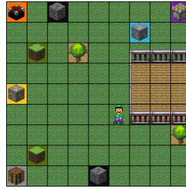
Figure 1: Minecraft-inspired domain containing natural resources, buildings where they can be processed, and perils such as zombies (adapted from [Andreas et al. , 2017]).

Tabular q-learning [Watkins and Dayan, 1992] learns policies by learning to approximate the optimal q-function. An approximate q-function \tilde{q}(s, a) is initialized in some manner