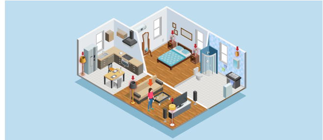
Figure 2: Implementation Interface

We implement our framework in a smart home scene. The demonstration, in which we constructed an SVCD with our framework, is a 2.5D virtual smart home space. The space represents the real smart home scene, contains an SVCD and multiple lights that can be manipulated by the user through the virtual smart speaker. Once it receives commands from the microphone, the SVCD will respond immediately. If it succeeds to surmise the user’s intent, a light shall be ignited. Conversely, if more information is required, it shall initiate a dialogue with the user automatically.