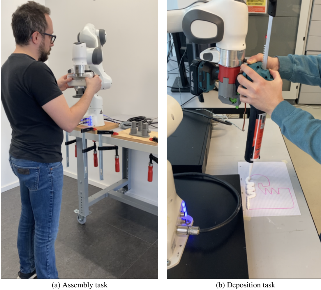
Figure 2: The tested (a) assembly task (where the gear has to be assembled into its shaft) and (b) deposition task (where the material has to be deposited along the highlighted path) are shown.

a critic ANN, which implements a Q-Learning algorithm for the resolution of a nonlinear optimal control problem. An ensemble of ANNs is exploited to estimate the model of the system. An MPC enhanced with stability guarantees (by means of Lyapunov constraints) is implemented to online compute the low-level impedance control parameters, maximizing the pHRC performance.