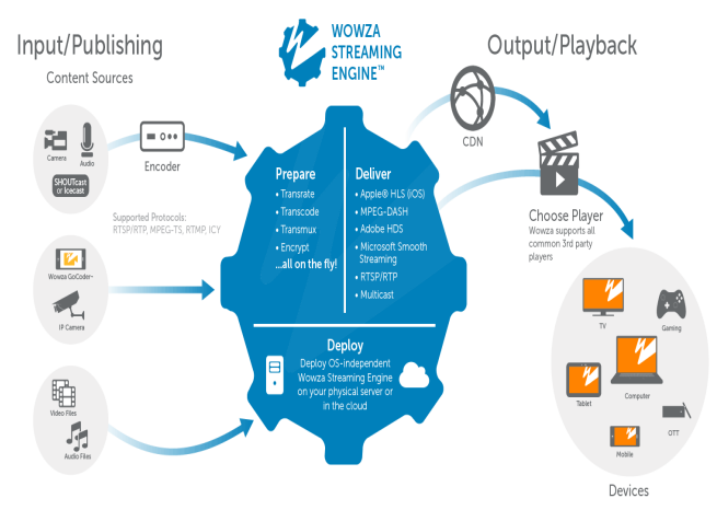
Fig .2.1 Video Streaming Process Flow in Wowza Engine