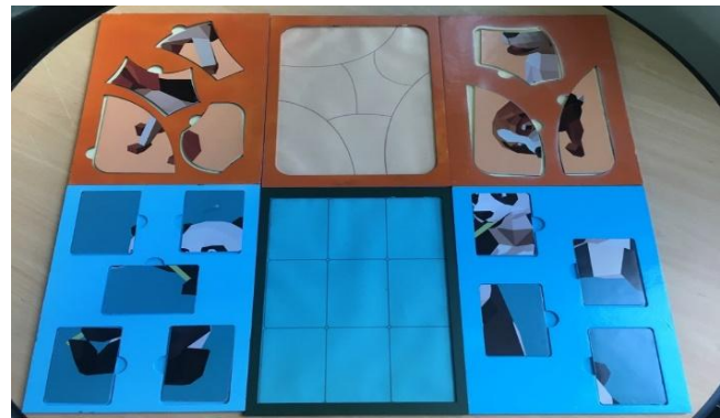
Fig. 4 Real-world puzzles with dog and panda images

The puzzle program consists of seven pieces of the dog puzzle and nine pieces of the panda puzzle. To differentiate the difficulty by puzzle, the dog puzzle pieces are made in different-shapes, and the panda puzzle pieces are made in the same-shape. Fig. 4 shows a real-world puzzle.