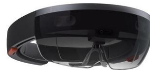
Fig. 1 HoloLens of Microsoft

To develop an MR-based puzzle program, a holographic lens, and a real puzzle, a 3D asset model, Unity, Visual Studio 2017, and Vuforia API are used. HoloLens is an MR-based wearable device developed by Microsoft. Unlike VR technology that shows a full virtual space, or unlike AR technology that is overlaid on the real world, HoloLens complements the real world by providing an MR function that enables users to print 3D images in the real world and manipulate them. In addition, because it has a built-in processor, it does not need to be connected to a smartphone or a computer; therefore, it can be moved around freely and can recognize a user's voice commands and the gestures of a user's fingers, so it is easy to control. The structure of the HoloLens is shown in Fig. 1, and the specifications are shown in Table 1.