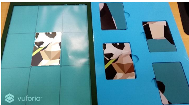
Fig. 6 Scene showing 3D animation when puzzle is completed

When the elderly wearing a HoloLens watch a puzzle piece that does not match, a hint is shown by converting the position of the puzzle piece into a 3D image (Fig. 6). After the elderly complete the puzzle, the HoloLens recognizes the completed puzzle and the image of the completed puzzle (puppy, panda) is displayed in 3D animation as shown in Fig. 7.