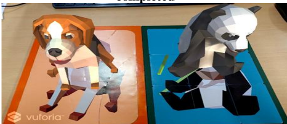
Fig. 2 Scene showing the location of the puzzle piece

This puzzle program was tested by 21 elderly people in an elderly welfare center. For the elderly to grow used to the HoloLens before the experiment, how to wear a device, the virtual-image description, the speech recognition method, and how to take a test were explained. The elderly subjects were able to adapt to VR/AR/MR by watching several sample images. For the two types of puzzle developed, the elderly solved only the puzzle for one kind without wearing the HoloLens and the puzzle for the other type wearing the HoloLens. In addition, the elderly solved one of the games that were open as VR puzzles. The elderly subjects' responses in terms of usability, ease of use, and satisfaction were collected. The results are shown in Table 2.