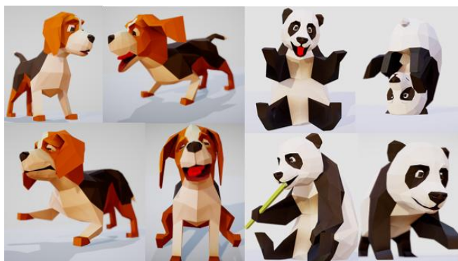
Fig. 3 3D asset model (dog and panda) used in this puzzle program

The puzzle program consists of seven pieces of the dog puzzle and nine pieces of the panda puzzle. To differentiate the difficulty by puzzle, the dog puzzle pieces are made in different-shapes, and the panda puzzle pieces are made in the same-shape. Fig. 4 shows a real-world puzzle.