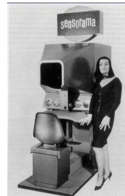
Fig 1. Sensorama

• Sensorama – The Sensorama Machine was invented in 1957 and patented in 1962 under patent # 3,050,870. Morton Heilig created a multi-sensory simulator. A prerecorded film in color and stereo, was augmented by binaural sound, scent, wind and vibration experiences. This was the first approach to create a virtual reality system and it had all the features of such an environment, but it was not interactive.