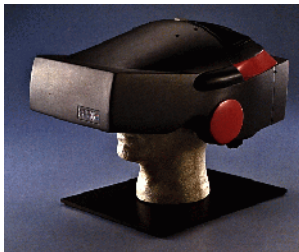
Fig 3. Head Mounted Display