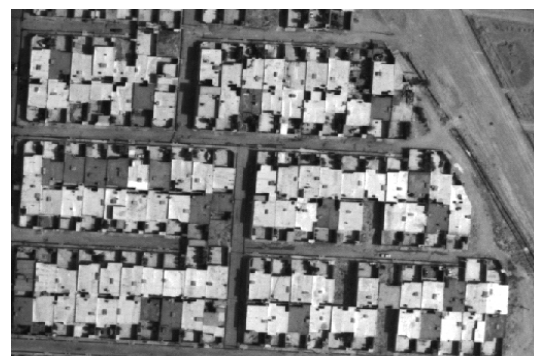
Figure 2: Gachsaran city as the test region

Our model is tested on an aerial image from Gachsaran city in Iran. The buildings in this image are dense and attached together. Figure 2 shows the image of test region.