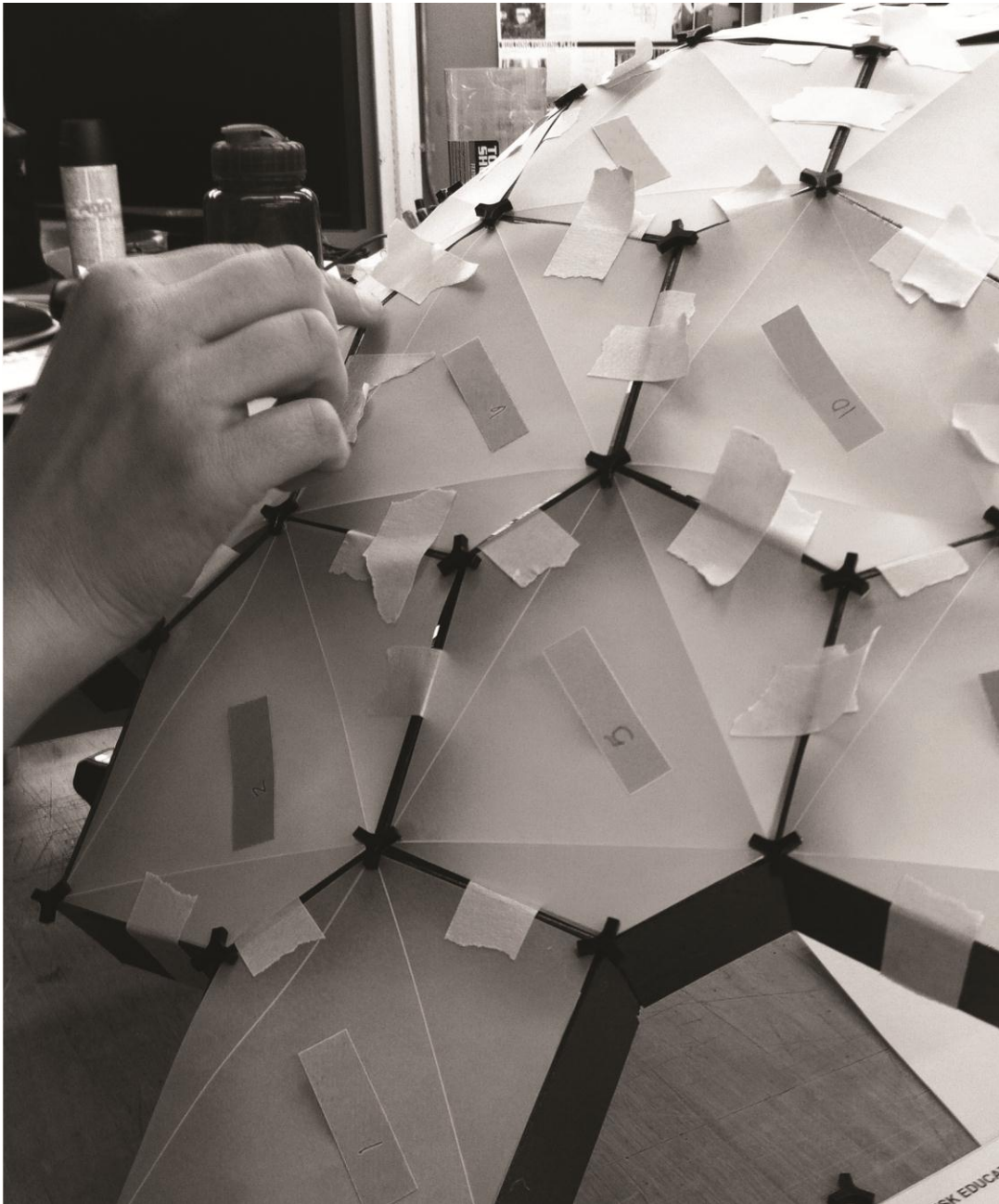
FIG. 4: Bees Knees construction of final product.

vellum as the material for to its flexibility and semi-transparent character. The laser cut and etched skin pieces for folding before being adhered to the acrylic connectors and the structure.