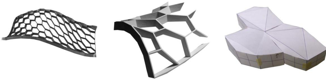
FIG. 2: Bees Knees virtual prototype (left) 3d printed prototype (center) and paper mock-up (right).