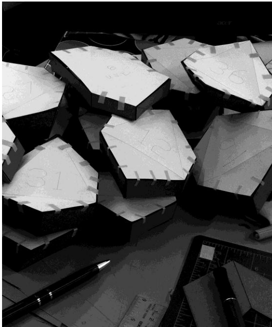
FIG. 3: Bees Knees honeycomb cells.

The final fabrication process incorporated the 3D printer, which was well suited for the structure due to its rigidity and accuracy (Figure 2, center). Using the 3D printer is not practical for producing the entire model due to the size requirements of the final product and the limitations of the 3D printer bed size. Following several prototypes to rationalize the geometry for the fabrication process of this doubly curved surface, work began on the final model.