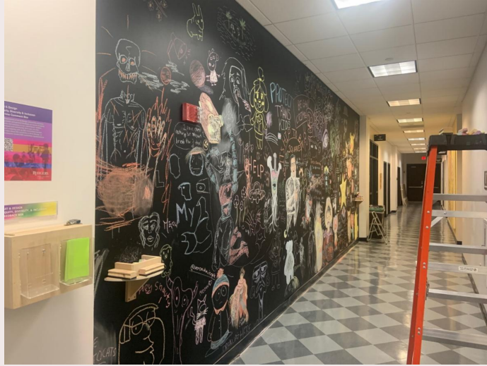
Collaborative drawing mural in hallway of Civic Square Building