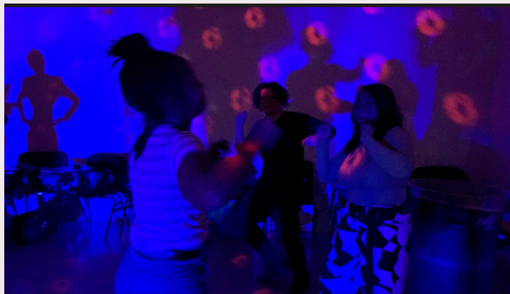
Friday night dance party!