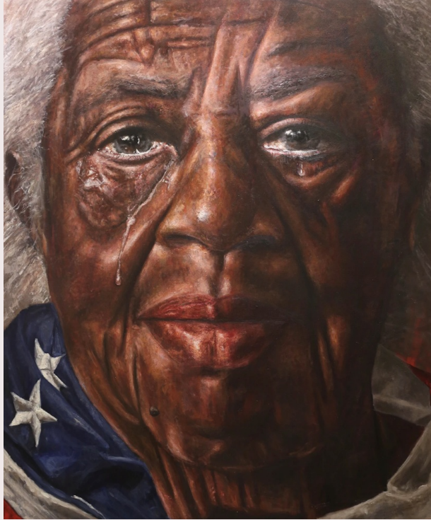
These Eyes Have Seen