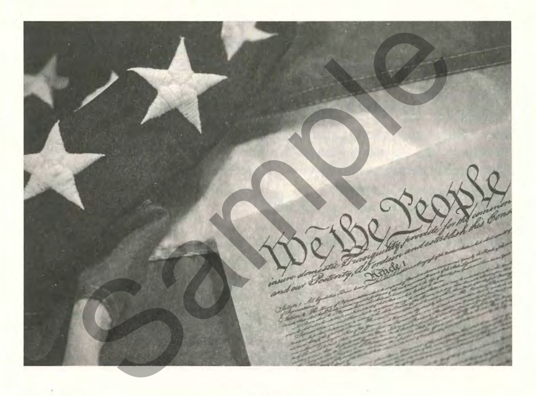
Editors of Research & Education Association