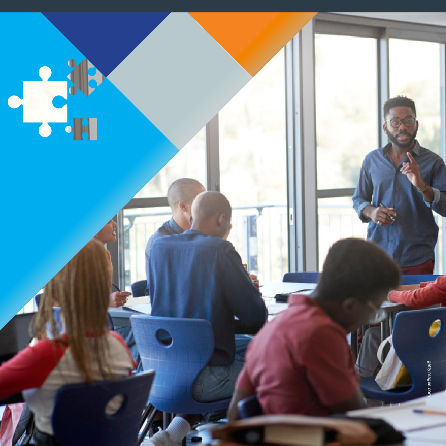
TABLE OF CONTENT