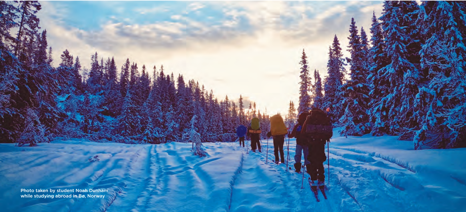
Photo taken by student Noah Dunham while studying abroad in Bø, Norway