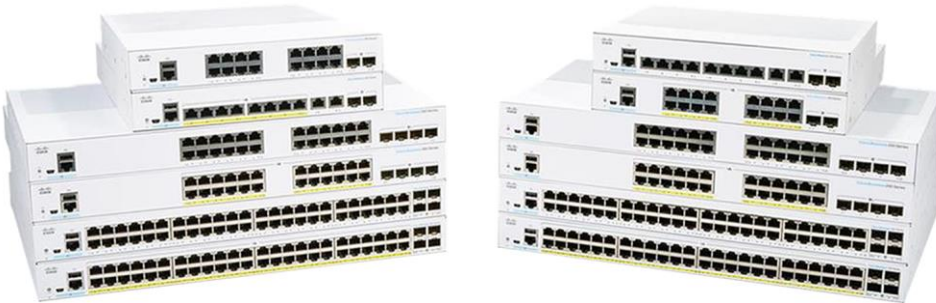
Figure 2. Cisco Business 350 series managed switches

The Cisco Business 350 Series Switches, part of the Cisco Business line of network solutions, is a portfolio of affordable managed switches that provides a critical building block for any small office network. Intuitive dashboard simplifies network setup, and advanced features accelerate digital transformation, while pervasive security protects business critical transactions. The Cisco Business 350 Series Switches provide the ideal combination of affordability and capabilities for small office and helps you create a more efficient, better-connected workforce. When your business needs advanced networking features and security for the digital transformation yet value is still a top consideration, you're ready for the Cisco Business 350 Series Switches.