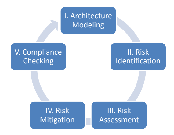
Figure 1: Architecture-driven Smart Grid Risk Management Approach

Most efforts on smart grid security either deal with threats and vulnerabilities on an abstract, high architectural level, or focus on very specific technical aspects, e.g., encryption or authentication, without considering the overall picture.