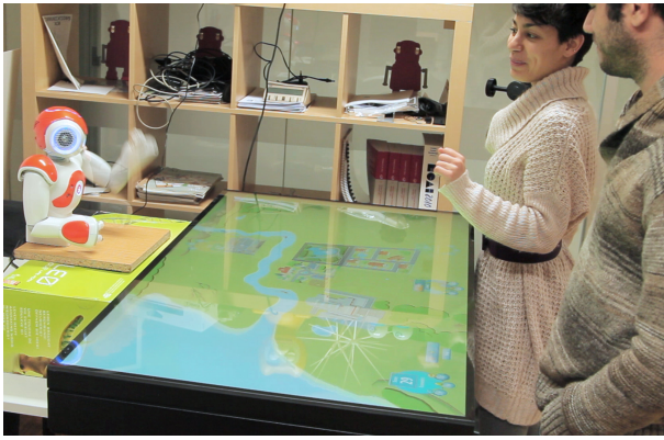
Fig. 2. Robotic tutor playing Energities with students