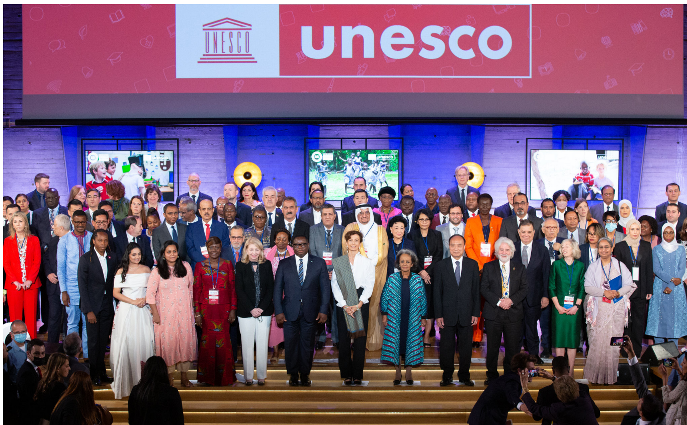
Group photo at the Closing segment of the Pre-Summit hosted by UNESCO in Paris.

The Pre-Summit also helped strengthen the synergies between the TES process and the SDG4 global cooperation roadmap in the lead up to the TES and the Summit of the Future in 2024. The SDG4-Education 2030 HLSC Leaders’ Group met and issued its ‘Urgent Call for Action for investing in education and transforming education around five Thematic Action Tracks’ . The International Commission also issued a statement on ‘Transforming education together for just and sustainable future’ issued in time for the Pre-Summit discussions, provided concrete directions for these changes.