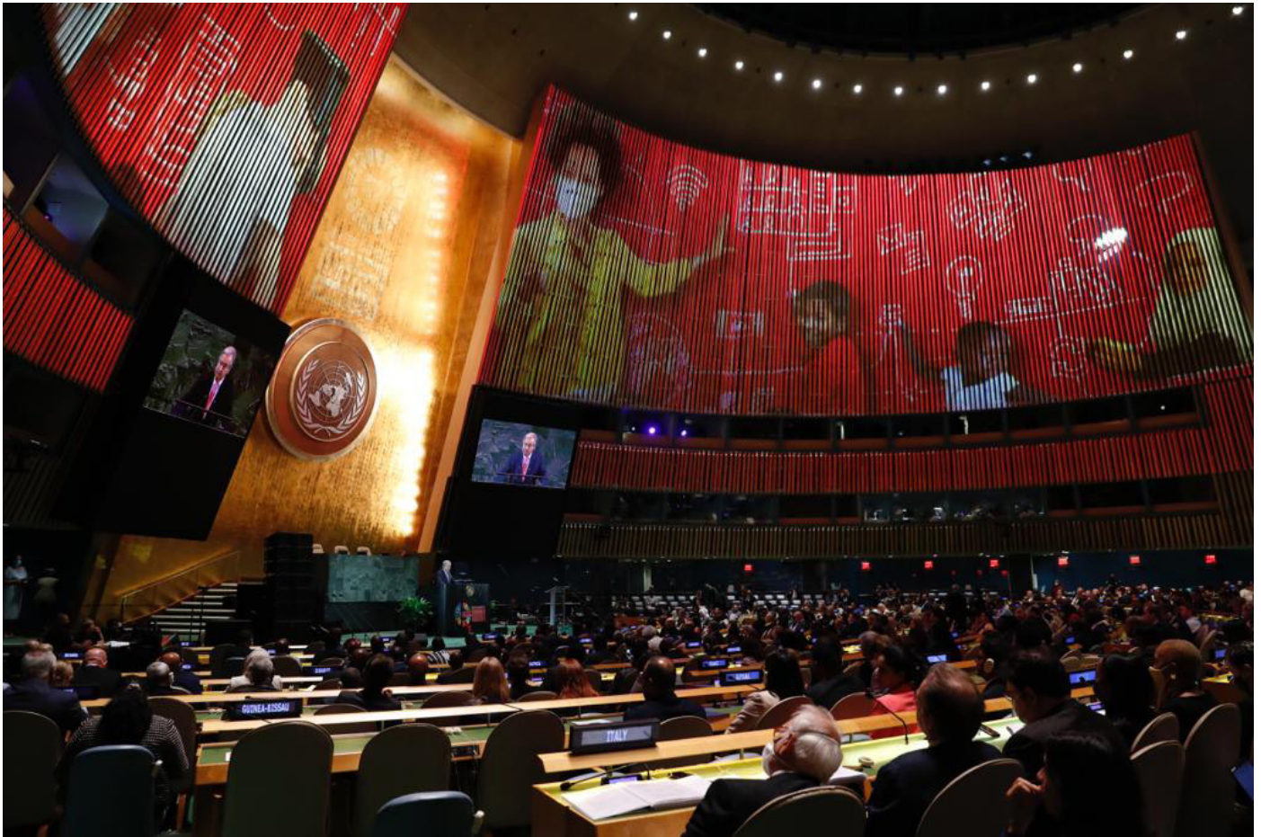
UN Secretary-General addressing the Transforming Education Summit on Leaders Day.

depends on all of us: on leadership, on enhancing existing systems, programmes, and governance; on greater financing; on civil participation and on our joint efforts.