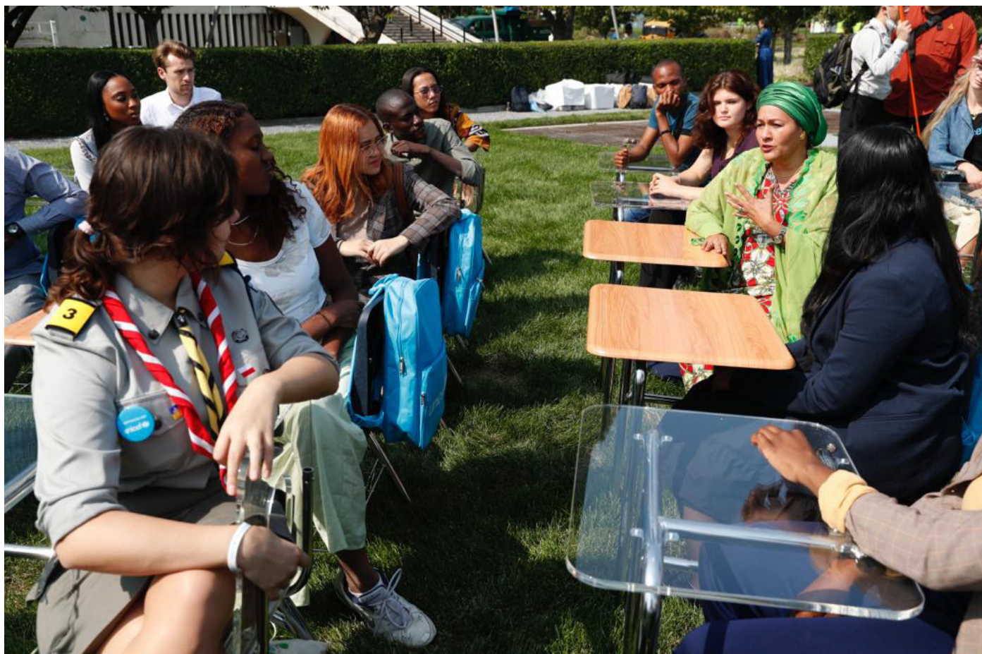
UN Deputy Secretary-General in conversation with young people at the UNICEF exhibition on the Global Learning Crisis.

education to the top of the global political agenda and to mobilize action, ambition, solidarity, and solutions to recover pandemic-related learning losses and sow the seeds to transform education for the breakthrough that our world so urgently needs.