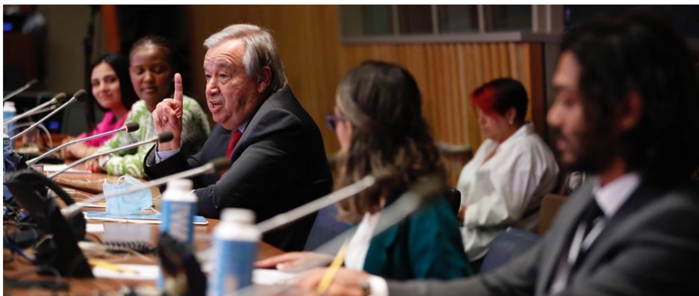
The UN Secretary-General address the Transforming Education Summit Youth-Led Mobilization Day: 'If I have to think of one single thing in which we should invest in, I would say education.' (Paulo Filgueiras)