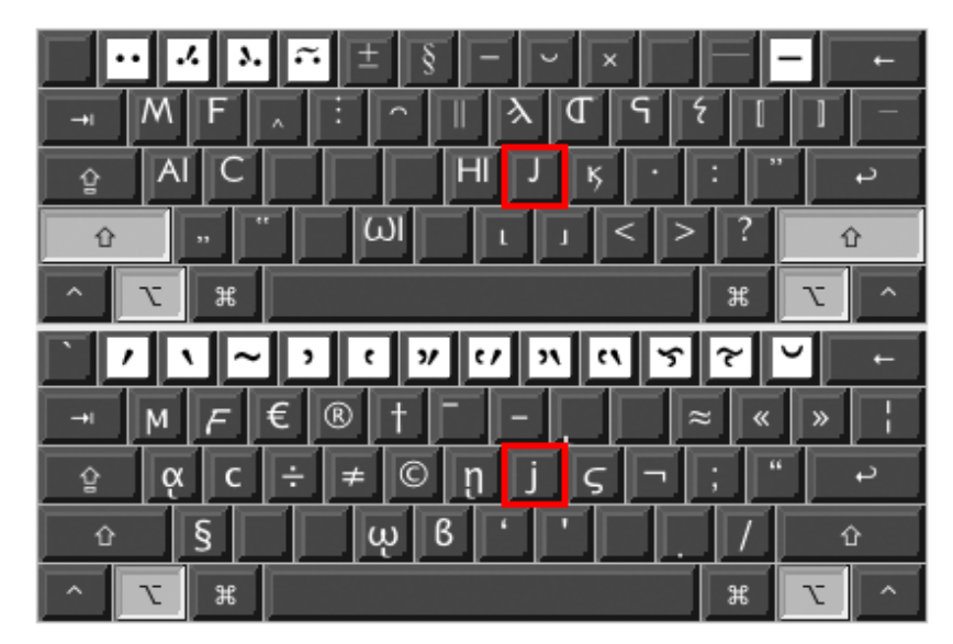
Figure 4. GREEK CAPITAL LETTER YOT and GREEK LETTER YOT in GreekKeys Unicode keyboard and font package