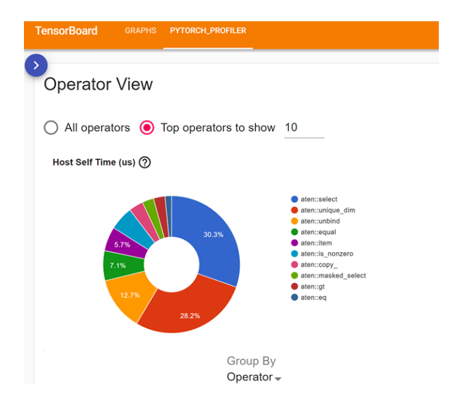
Figure 2: Runtime breakdown of the top operators for a selected query. The view is automatically generated within TQP by the Pytorch Profiler, and visualized on TensorBoard. allow audience to interact with the Python Notebook: for example,

by editing the queries taken as input by TQP, by changing the backend/device configurations, or by exploring the UI.