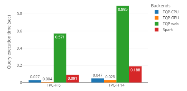
Figure 1: Query execution times for TPC-H 6 and 14 on Spark, and TQP on CPU, GPU, and web browser.

We use an Azure NC6 v2 machine equipped with 112 GB of RAM, an Intel Xeon CPU E5-2690 v4 @ 2.6GHz (6 virtual cores), and an NVIDIA P100 GPU (with 16 GB of memory). We run both TQP-CPU and Spark over all cores. We report the median of the execution time over 5 runs, after 5 warmup runs. The web backend runs on our personal laptop (a Surface Book 3) to mirror a common client-facing scenario. As shown in Figure 1, TQP on CPU is around 3× faster than Apache Spark on both queries, while GPU execution is 20×, and 6× faster, respectively. As expected, the web execution is quite slow. Besides the weaker computation power on the personal laptop, the performance of TQP on the web browser is depending on the efficiency of ORT, Web Assembly, and the JavaScript environment. Nevertheless, this last result shows the flexibility of TQP, and its ability to leverage available open source ML tools.