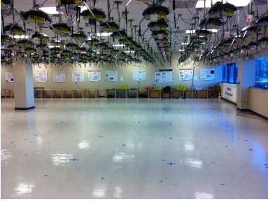
Figure 1. 10 wireless transmitters and 6 receivers are deployed in this 20 \times 20 m open space.