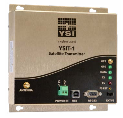
Figure 1:YSIT-1 GOES Satellite Transmitter