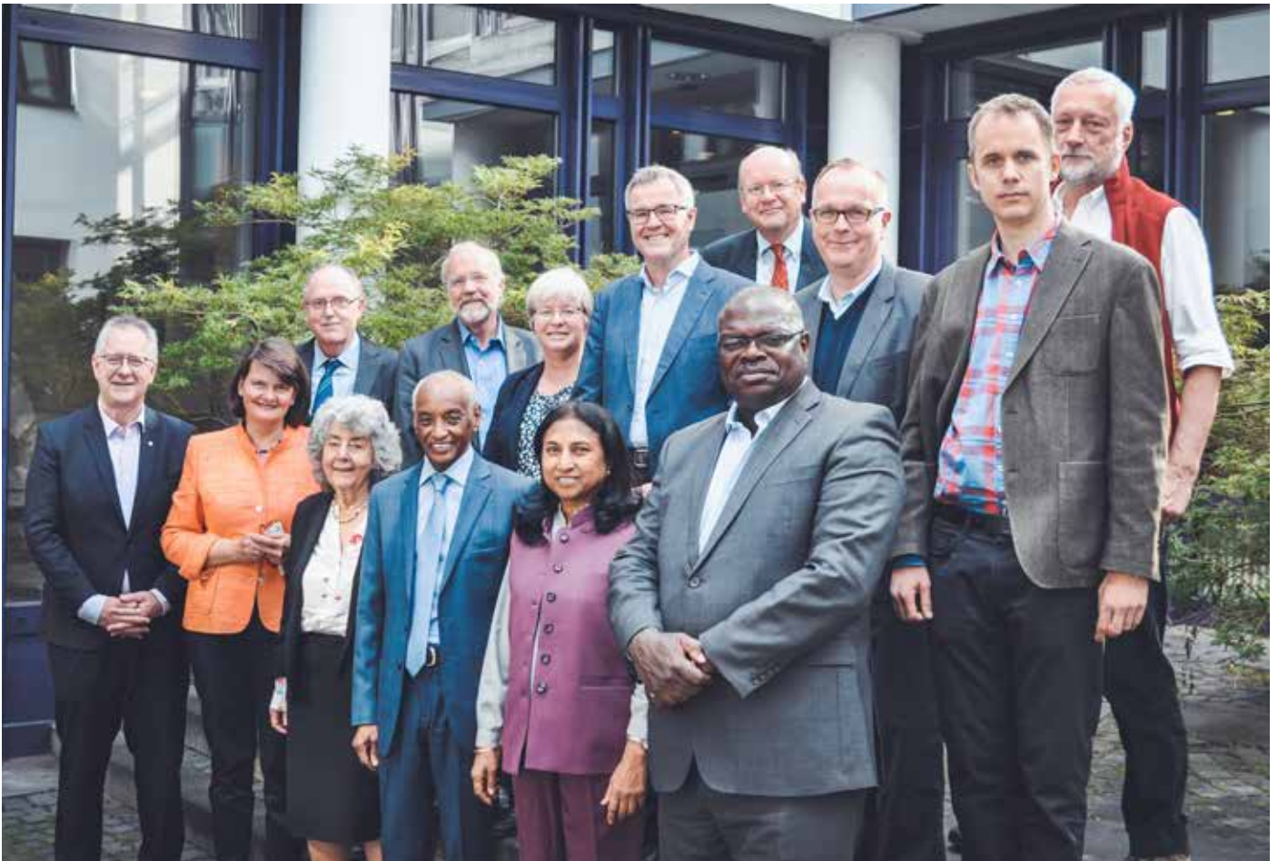
ZEF's International Advisory Board Meeting in Bonn, 2019.

4 Senior Fellows are internationally renowned and experienced scientists who are interested and involved in ZEF's research and development agenda. They contribute to the training of ZEF doctoral students, may give occasional lectures or seminars and supervise students. Senior Fellows are not employees of ZEF, but visit the institute on a regular basis.