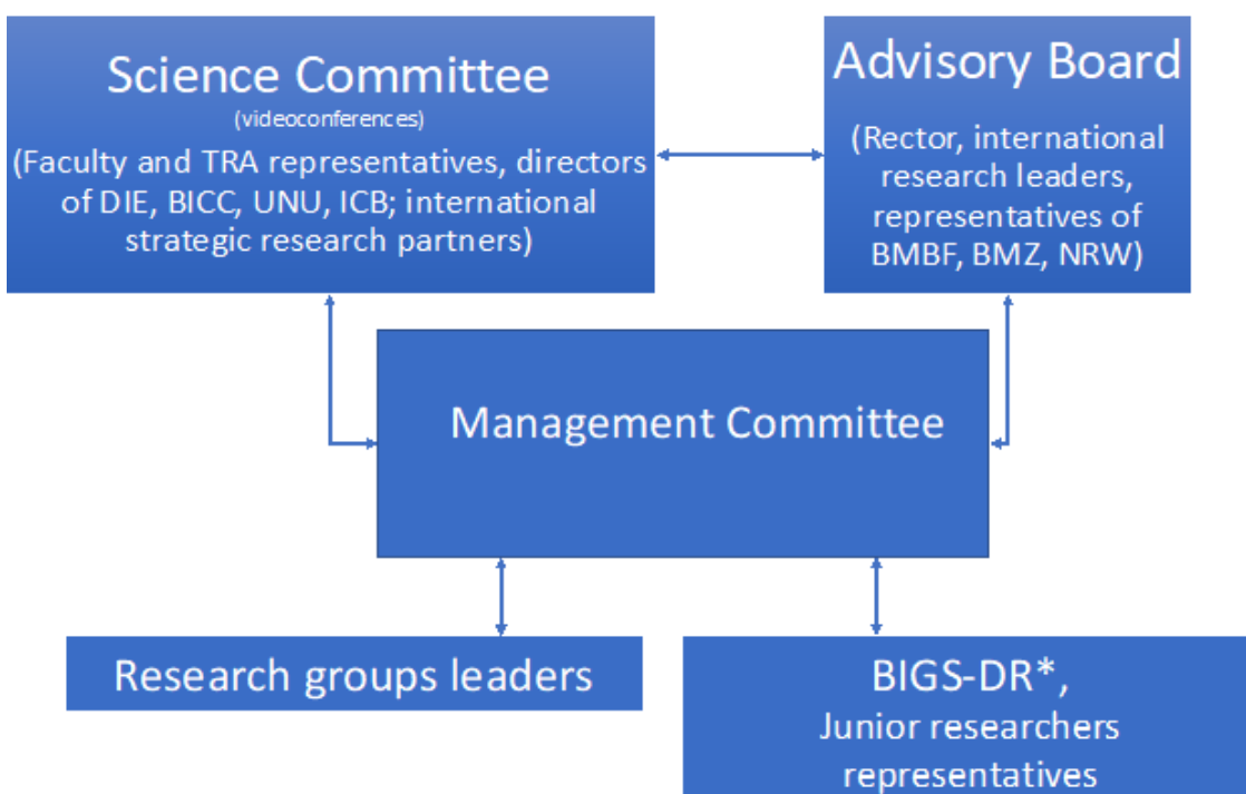
ZEF's new governance structure (*BIGS-DR also has its own committees, etc.)

Experienced ZEF senior researchers will be encouraged to establish research groups implementing the new transdisciplinary research foci of the center, thereby replacing the existing rigid departmental structure. Coupled with the forthcoming generational change in ZEF's leadership team, this new structure will assure the core expertise of ZEF in economics, social and natural sciences and the successful implementation of the new research strategy.