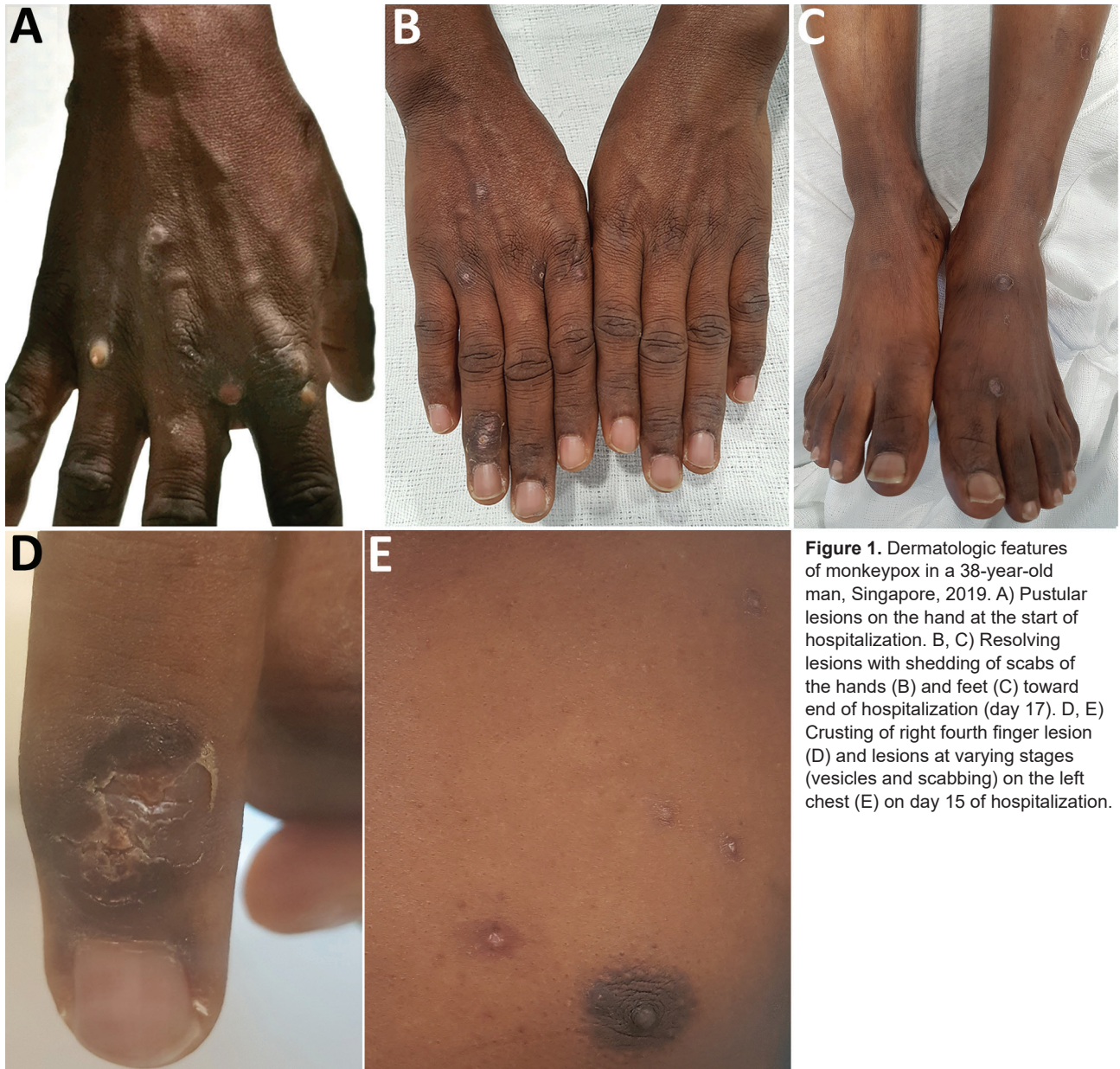
Figure 1. Dermatologic features of monkeypox in a 38-year-old man, Singapore, 2019. A) Pustular lesions on the hand at the start of hospitalization. B, C) Resolving lesions with shedding of scabs of the hands (B) and feet (C) toward end of hospitalization (day 17). D, E) Crusting of right fourth finger lesion (D) and lesions at varying stages (vesicles and scabbing) on the left chest (E) on day 15 of hospitalization.

but negative for variola virus on the BioFire FilmArray Biothreat Panel version 2.5 ( https://www.biofire.com ). We confirmed orthopoxvirus from swab specimen using a panorthopoxvirus PCR targeting E9L (DNA polymerase) (6) and by direct visualization of virus particles using transmission electron microscopy, which showed features characteristic of orthopoxviruses (Figure 2, panels A, B) (7).