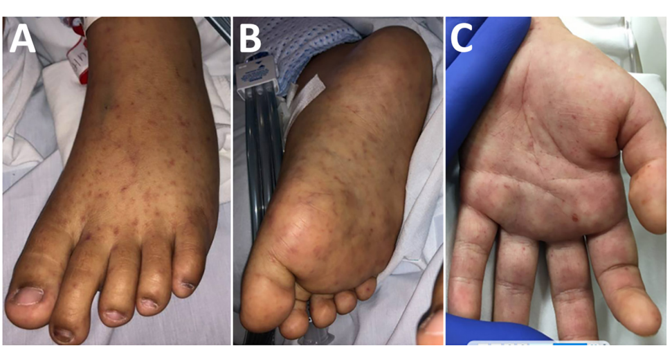
Figure 2. Characteristic petechial rash on the palms and soles of children with Rocky Mountain spotted fever treated at Rady Children's Hospital, San Diego, California, USA.

A previously healthy 4-year-old boy from Alpine, California, a small town ≈18 miles north of the California-Mexico border, sought care for 6 days of fever accompanied by hypotension, abdominal pain, and periorbital and peripheral extremity edema. At the onset of fever, he was seen at an urgent care and prescribed amoxicillin for acute otitis media; 4 days before admission, a rash developed on his thighs and extremities that was initially attributed to drug reaction. The fever and rash persisted, and he came to the Rady Children's Hospital emergency department on day 6 of illness. He had a history of exposure to farm animals, including dogs and chickens, but no known tick exposure. Empiric ceftriaxone and vancomycin were started, and he was admitted to the pediatric ward. He was escalated to the intensive care unit on HD2 for bilateral pleural effusion and respiratory distress; empiric antimicrobial drugs were broadened to cefepime, doxycycline, and vancomycin upon admission to the PICU. Lumbar puncture and CNS imaging were not performed. Both RMSF serology and mcf-DNA were sent on HD3. Both mcf-DNA noting Rickettsia and serology results were returned after patient discharge, 6 days after being sent. He was treated with 10 days of doxycycline and a combined 7 days of cephalosporin therapy for presumed culture negative sepsis. He was discharged to home at his baseline level of health.