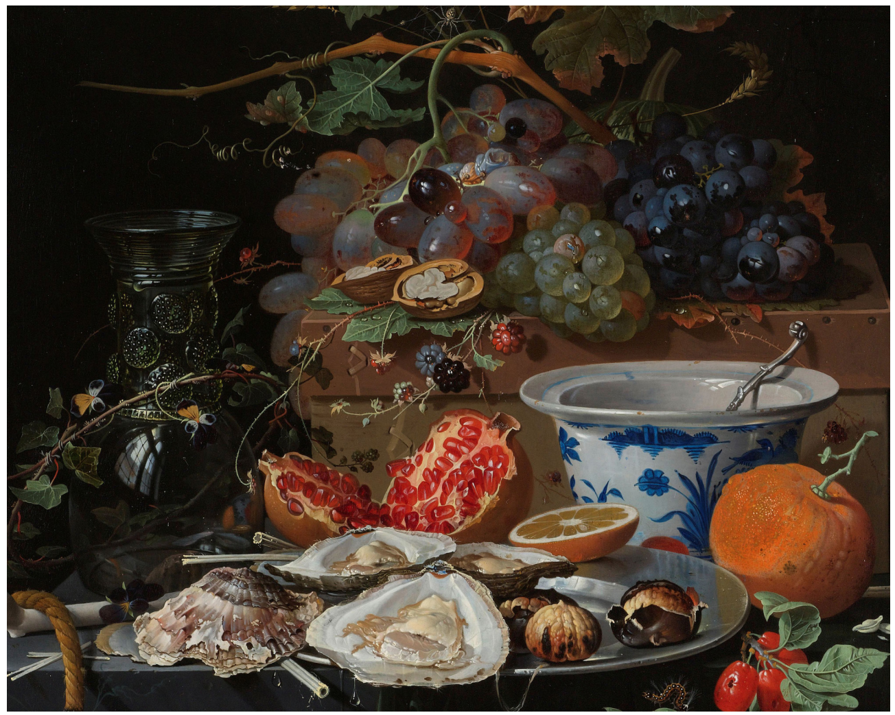
Abraham Mignon (1640–1679, Still Life with Fruits, Oysters and a Porcelain Bowl (1660–1679) (detail). Oil on panel, 21.7 in × 17.7 in/55 cm × 45 cm.