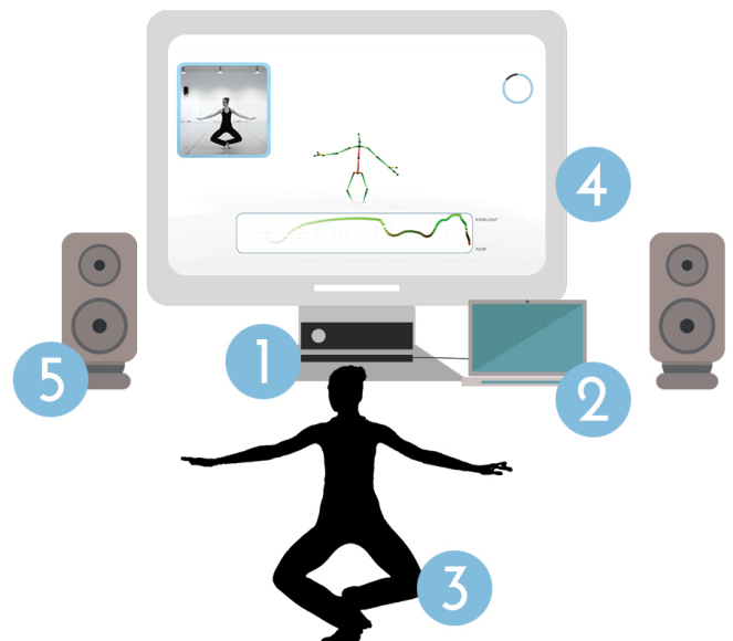
Figure 3: The Interactive Ballet Application: 1) a Kinect v2 connected to 2) the computer, 3) a dance student, 4) a screen displaying the instructor video (top left), 4) a screen displaying the instructor video (top left) and the real-time visual feedback (center: skeleton with color coded position deviations, bottom: visual performance curve), 5) speakers for auditory feedback.

The final prototype consisted of a Kinect v2 which was connected to a computer that makes it possible for the system to identify a user's skeletal points. This data determines both the visual and auditory feedback, provided through a screen and speakers. A virtual teacher is implemented in the upper left corner in order to instruct the user in the movements. For the full setup see Figure 3.