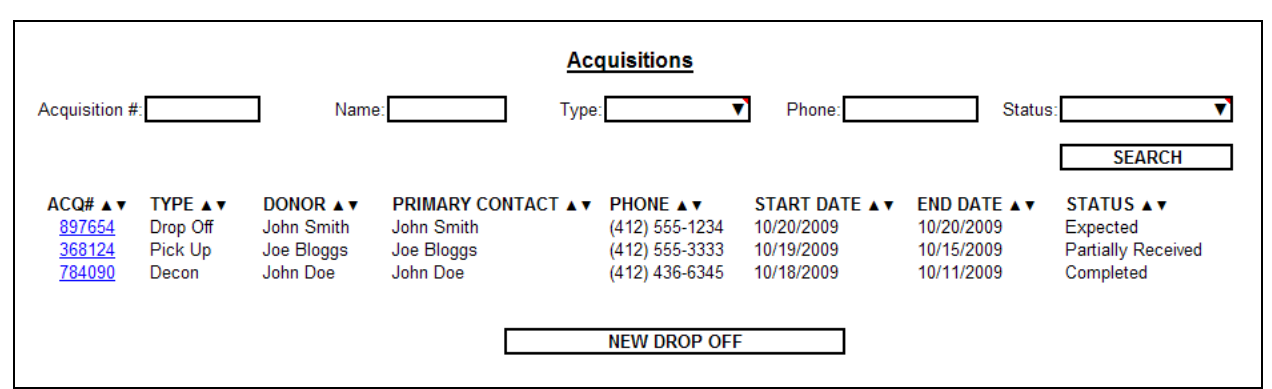
Figure 24 – View/Search Acquisitions Screen