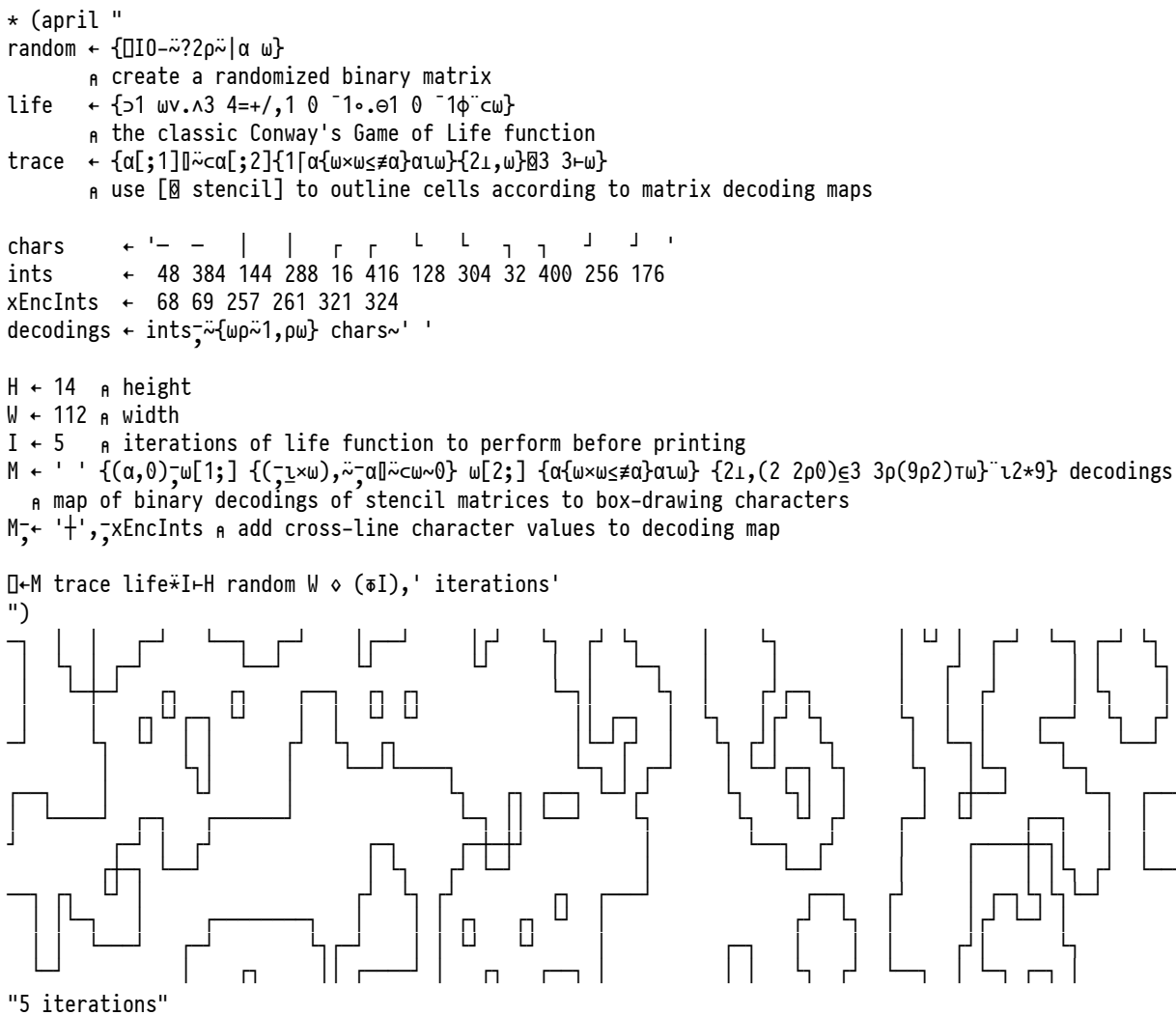
Figure 2: APL evaluated via April implementing the Game of Life function with a convolution kernel to outline cells